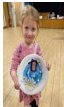
December Messy Church